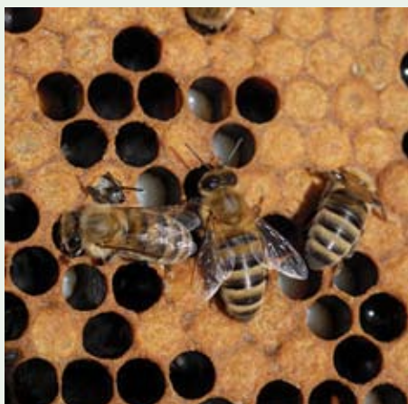
Honey bees in the hive.