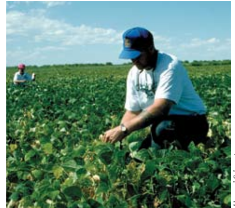
Common bean field inspection.

The 2008 Legume ipm PIPE Web site will include a series of menus, maps, reports, illustrations, and management links for topics that may include: