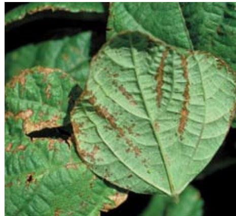
Bean Brown Spot.