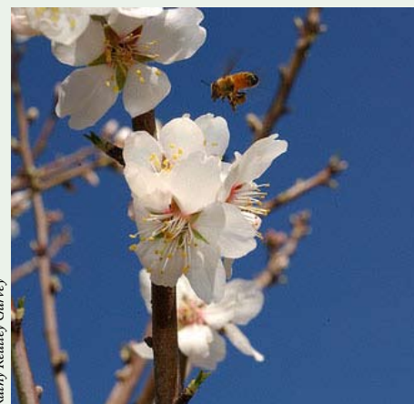
Honey bee zeroing in on an almond blossom.

Another suspect: Gaucho® (imidacloprid), used as a seed treatment on sunflowers. Beekeepers claimed that when bees visited sunflowers, they never returned to their hives; “they lost their memory.” Mussen said no scientific documentation exists to blame imidacloprid for the bee die-off. A study found only 5 parts per billion (ppb) maximum in the nectar of sunflowers and canola, he said. The Bayer fact sheet