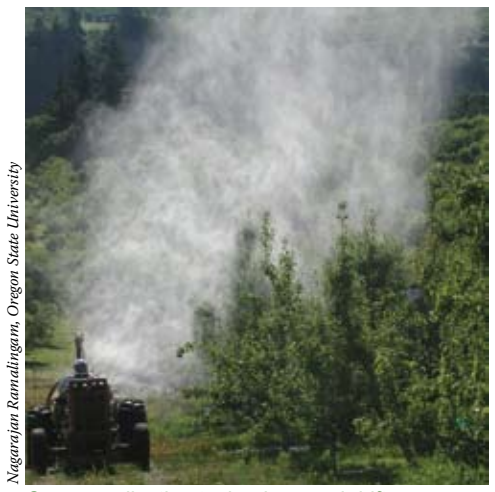
Spray application technology and drift management outreach has been a key aspect of the IPPC outreach program in the past five years.

The IPPC has established a core facility that continues to deliver certification programs for pesticide applicators; develops and delivers