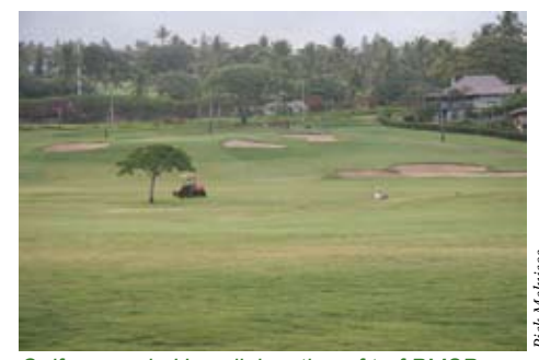
Golf course in Hawaii, location of turf PMSP workshop in May.

Non-Rangeland Forages (Excluding Alfalfa) in the Western States: Posted on the national website in late September.