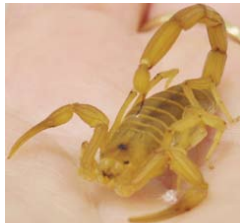
Bark scorpions are a serious pest in some schools. Children under seven who are stung require emergency medical intervention.

Asthma. The worldwide rates of asthma have been increasing in recent decades, especially in developed countries. The World Health Organization reports that the number of asthmatics in the United States has leapt by more than 60 percent since the early 1980s. Asthma is one of the leading causes of school absenteeism. There are known genetic factors that predispose people to the development of asthma, but many studies suggest that environmental factors are also key elements causing the increase in disease incidence ( Institute of Medicine, 2000 ). Urbanization appears to be correlated with