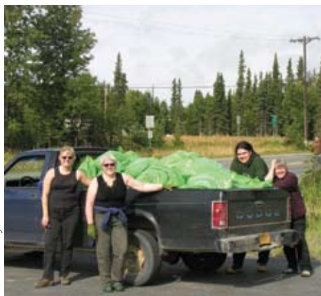
Cooperative Weed Pull earlier this year to pull hawkweed.