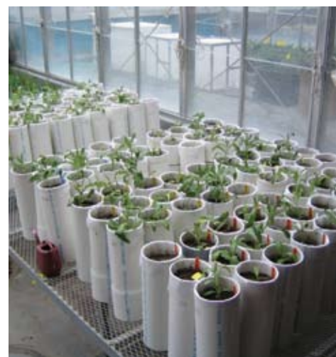
Greenhouse study evaluating the joint impact of herbicides and two biological control agents on the emergence and growth of Canada thistle.

The foliar biological control agent Bacillus mycoides isolate J (BmJ) controls disease by inducing systemic resistance in plants to pathogen attack. This results in the potential for disease control of a wide array of pathogens including fungi, bacteria, and viruses. BmJ is under commercial development. This project's objectives were to 1) evaluate the potential of foliar applications of BmJ for control of PVX and PVY; 2) assess biological and chemical treatment regimes for control of foliar and soilborne diseases in the field; 3) demonstrate relative effectiveness of biological