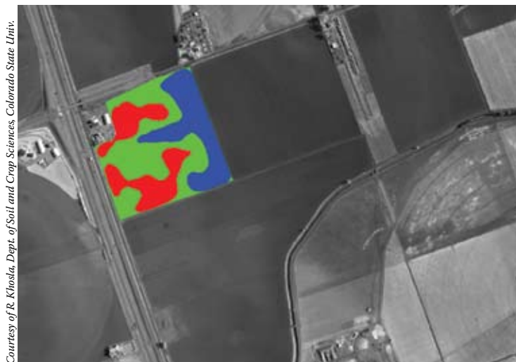
A 20-acre field at the Colorado State University Agricultural Research Education and Development Center was categorized into low- (red), medium- (green), and high-yield (blue) potential (or site-specific management) zones, based on soil color and topography.