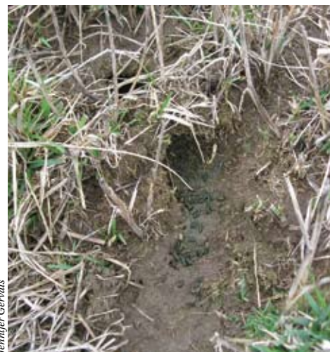
Vole burrow with fresh droppings and signs of recent herbivory.

Summary: Voles are a difficult crop pest for growers to manage because of the wide fluctuations in their population numbers. Voles typically exist at lower densities that do not cause substantial damage, but at times their populations build to levels that cause widespread crop losses. If control measures are undertaken before voles begin to build rapidly, population peaks may be either averted or lessened, with a corresponding decrease in crop losses. The goal of this project was to test various methods of monitoring vole population density by measuring their signs, such as burrow entrances and runways. If farmers had a reasonably simple, precise way of determining vole numbers, they could