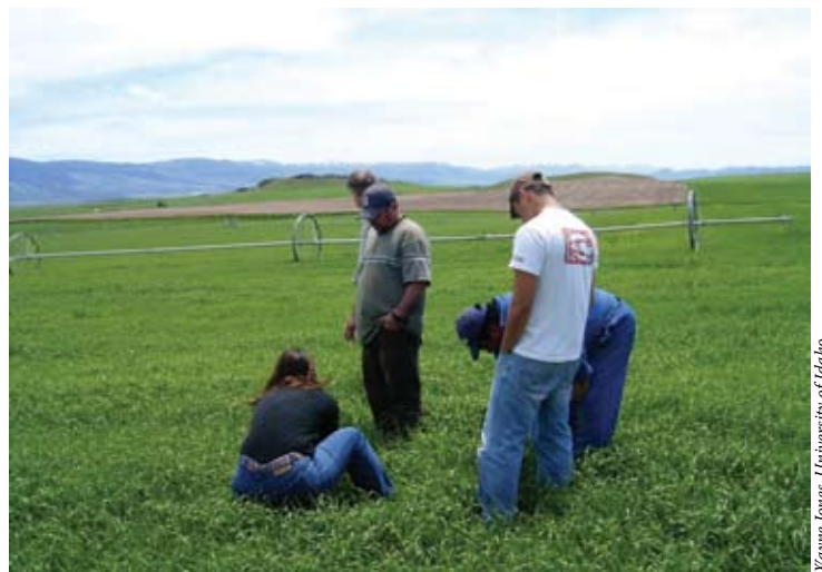
Teaching field workers how to scout for pests, the foundational element of the IPM project.

Impacts and Potential Impacts: Because of investigators' work with NRCS and some commodity groups utilizing the pest management information of the matrix, Idaho paid for pest management on 25 contracts. This was the first time that was accomplished. Investigators have not measured the adoption rate of use of the matrix. However, some NRCS staff have used the matrix information to help them discuss IPM options with producers. They believe that more educational efforts and the addition of the Web interface with the OnePlan IPM planner will eventually expand the use of this material. NRCS implemented a cost share program for pest management, and having the matrices available encouraged that decision.