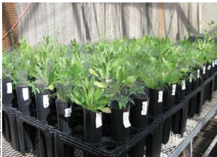
Matt Schultz, Colorado State University

Results: Objective 1: In greenhouse studies, knapweed chemical-resistant species and oxalic acid treatment did not improve native species biomass, suggesting that these resistant species are not good nurse crops