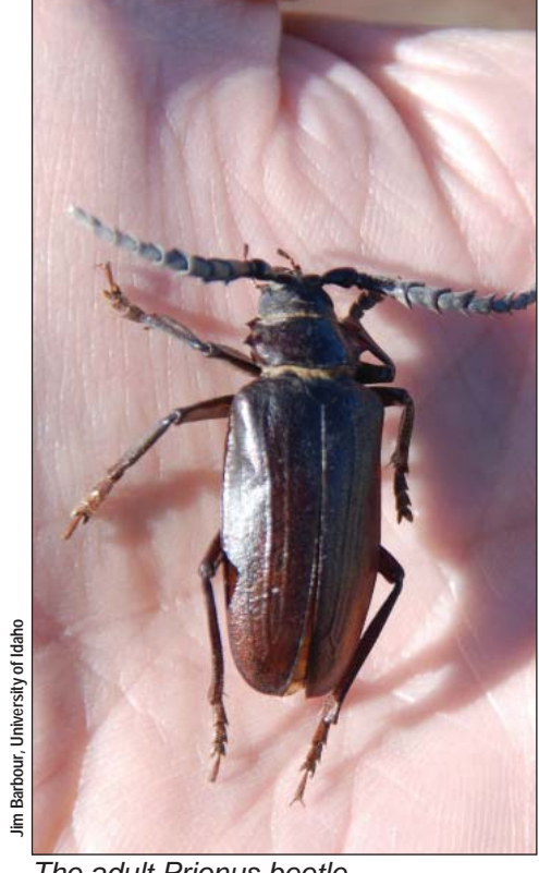
The adult Prionus beetle.

"Mating disruption is easier in some respects because you don't have traps to