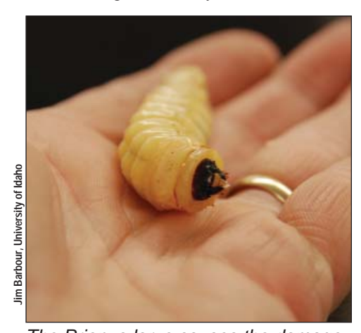
The Prionus larve causes the damage.

"The larvae are root-feeders," Barbour said. "They grow to about three inches long, and one or two of them really make a mess of hop roots and the roots of some fruit trees. In fact, one old name for the beetle was the Giant Apple Root-Borer."