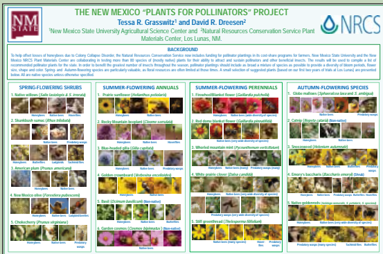
Want to attract bees? Just look to the poster.

Using test plots in four geographically distinct sites throughout the state, the team planted hedgerows of