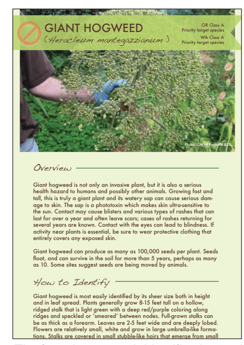
The fact sheets teach identification and control methods for 10 invasive weeds.

by 60 people, and printed 2,000 copies of each fact sheet, including 500 each in Spanish. They are available for download at www.4countycwma.org.