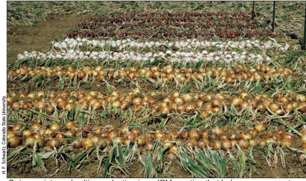
Onion variety and cultivar selection is an IPM practice that helps manage pests.

"We're seeing good adoption of IPM by growers, either as individuals, or coming from crop consultants.