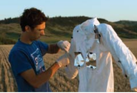
Collection of insecticide deposition receptors on mannequin.

Summary: IPM programs for mosquitoes are advanced in many areas. However, to address technical and public concerns, there was a need to empirically explore uncertainties about environmental concentrations and fate of mosquito adulticides delivered via ultra-low-volume (ULV) application. This project's objectives were to: 1) experimentally derive actual environmental concentrations of ULV insecticides and then use them to develop a statistical model relevant to ULV applications, 2) share the results and model with all relevant stakeholders, 3) develop a novel lower-cost method that mosquito management districts could use