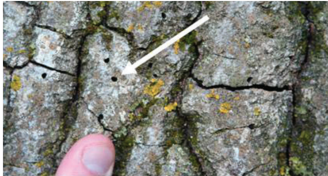
When new adult beetles emerge, they create D-shaped exit holes about 3/16 of an inch (4 mm) in diameter. These exit holes indicate that tree damage is extensive.