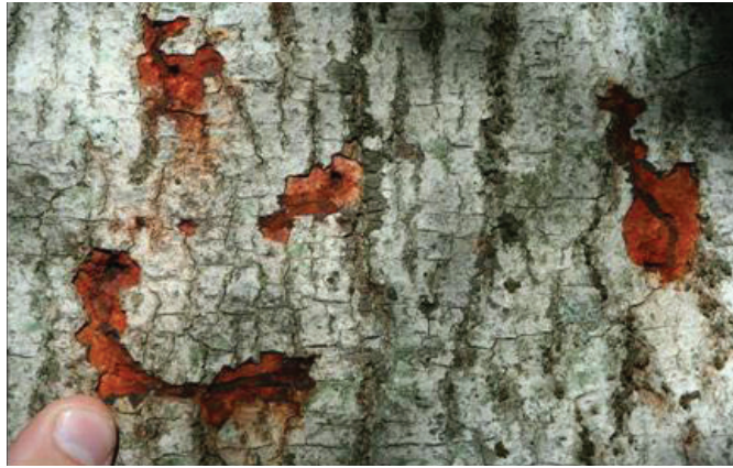
Woodpeckers chip away outer bark to forage on goldspotted oak borer larvae. Woodpecker foraging in coast live oak exposes the dark larval galleries and inner bark.