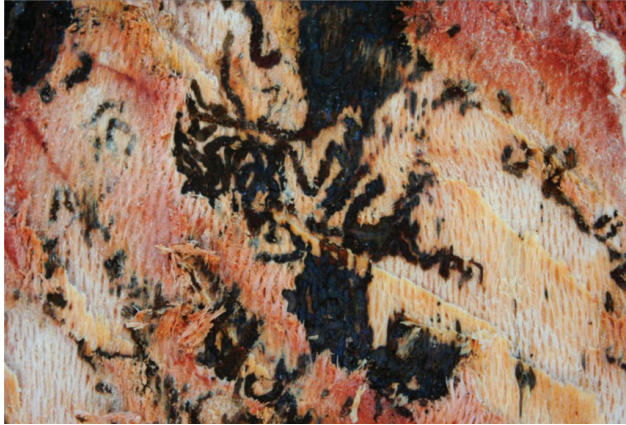
Feeding galleries of the goldspotted oak borer larvae are often black in color with no specific pattern. Larvae feed under the bark primarily on the wood surface.