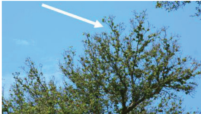
Twig die-back and crown thinning can be symptoms of goldspotted oak borer injury.