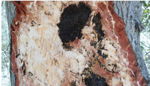
High densities of larval galleries can patch kill areas of inner bark and lead to tree death. Patches of dense galleries are often indicated by dark, wet staining on the bark exterior.