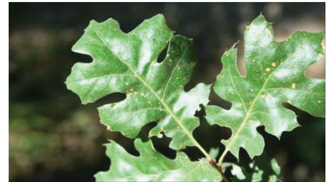
California black oak is a deciduous species that is found at higher elevations, 5,000-7,000 feet in southern California.