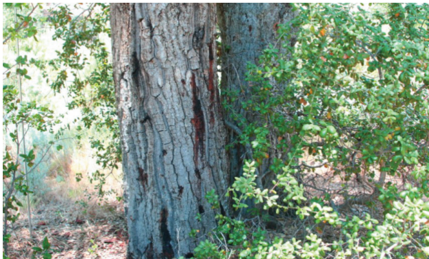
Black or red staining on the main stem or larger branches can signify injury from the goldspotted oak borer.