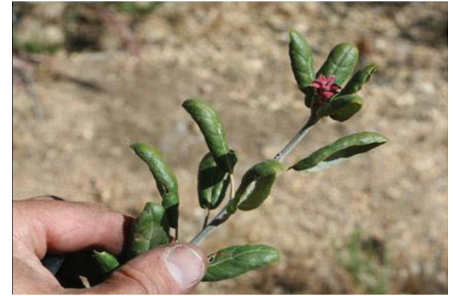
Coast live oak is an evergreen species with cupped leaves. Its acorns are slender and sharply pointed.