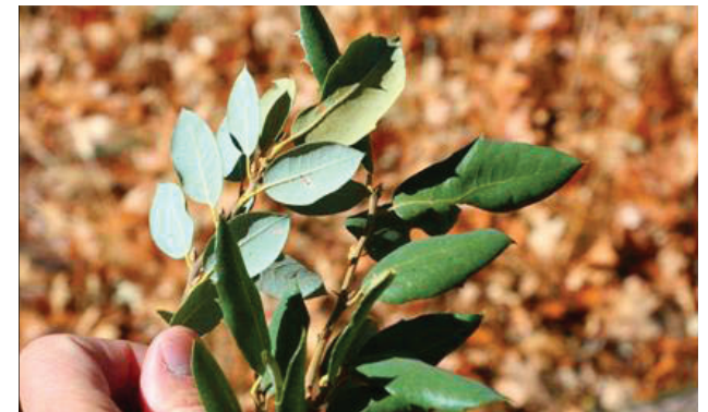
Canyon live oak is an evergreen species. The underside of older leaves appear gray; newer leaves have fine red hairs.