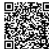
Produced by the Western Region Tribal Integrated Pest Management (IPM) Work Group ( http://www.westernipm.org/index.cfm/center-projects/project-websites/tribal-work-group/) with funding from the Western IPM Center

http://www.gsob.org http://www.ipm.ucdavis.edu/PMG/PESTNOTES/pn74163.html