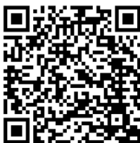
Produced by the Western Region Tribal Integrated Pest Management (IPM) Work Group ( http://www.westernipm.org/index.cfm/center-projects/project-websites/tribal-work-group/) with funding from the Western IPM Center

http://www.ipm.ucdavis.edu/PMG/PESTNOTES/pn7422.html http://ufe.calpoly.edu/forestry/detail.lasso?rid=51