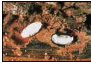
Figure 9. Larvae transform to pupae within cells constructed at end of feeding gallery.