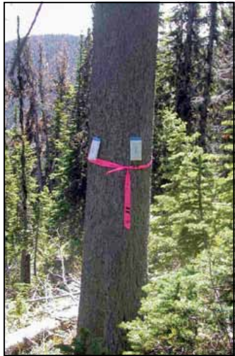
Figure 14. Verbenone can be an effective preventive treatment in some situations.

Synthetically produced pheromones are registered and periodically reviewed by the U.S. Environmental Protection