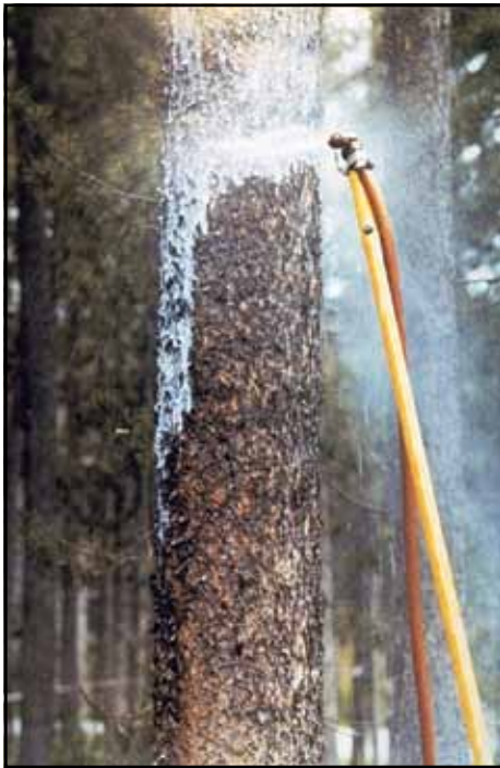
Figure 13. Preventive treatments can successfully protect susceptible hosts from mountain pine beetle attacks.

Pheromones. As noted previously, beetles produce both aggregative and anti-aggregative pheromones that are used to manipulate their populations to their advantage. Many of these “message-bearing” chemicals have been identified, and their