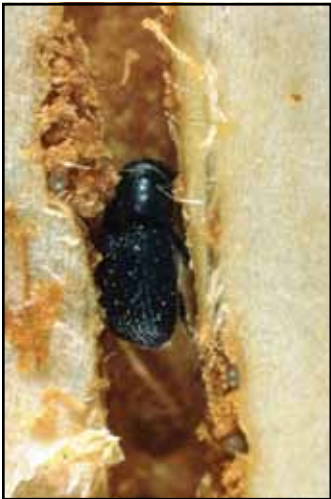
Figure 7. Mountain pine beetle adult and eggs in egg gallery.