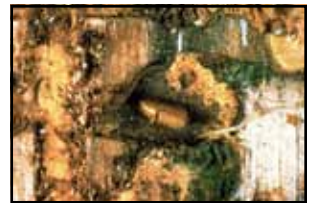
Figure 10. "Callow" or immature adults darken before emerging to complete life cycle.