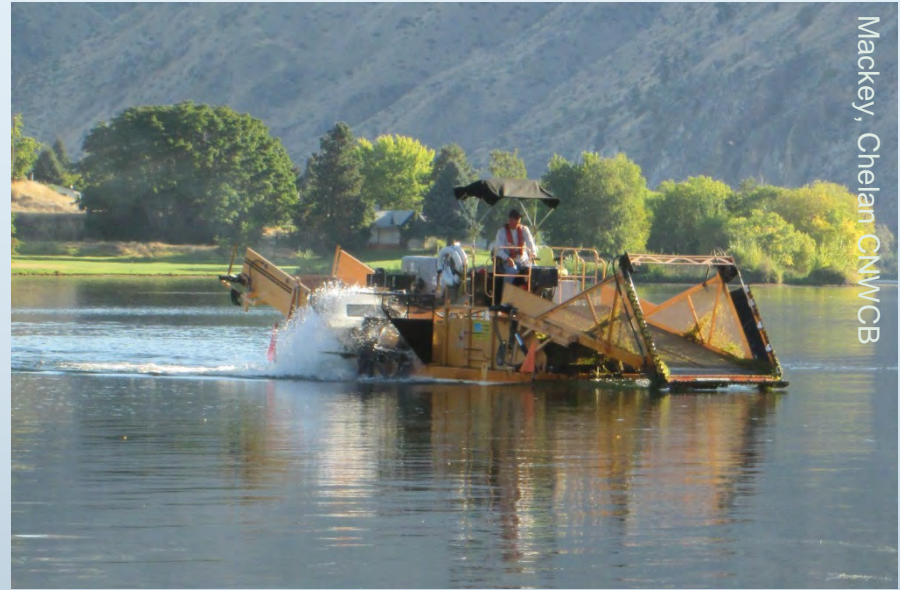
Mackey, Chelan CNWCB